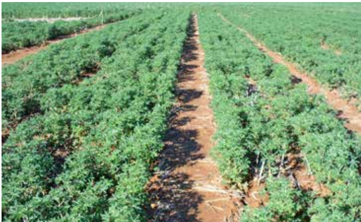
Photo 1: Albus lupins at Incitec Pivot Fertilisers' Grenfell long term trial site in 2010. The nil P with the seed is the plot on the left, showing better establishment than the 10 kg/ha of phosphorus as triple superphosphate treatment in the plot on the right.