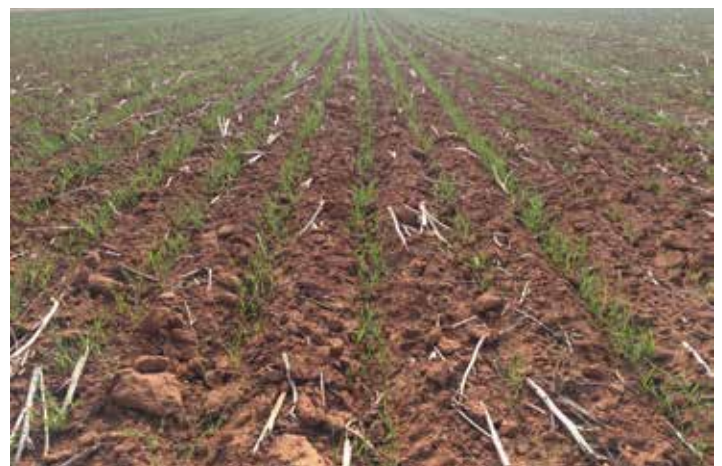
Photo 3: An example of a twin row seeding system with Gregory wheat at Grenfell in 2018.

The safest application equipment allows the fertiliser and seed to be applied in separate bands. Applying fertilisers below and to the side of the plant line with a minimum of 50 mm of separation is the most effective method of avoiding seed or root contact in winter crops. Also consider twin row, dutch opener type systems that give excellent flexibility with fertiliser applications.