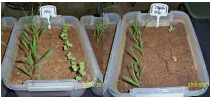
Photo 2: No fertiliser (left) was better than 25 kg/ha of urea (right) for the canola in this seed sensitivity test.

The difference in tolerance between canola and wheat can be seen in the trays in Photo 2. They were prepared with urea applied with the seed simulating a 33 cm row spacing with a seed furrow width of 25 mm, or an SBU of 7.6%.