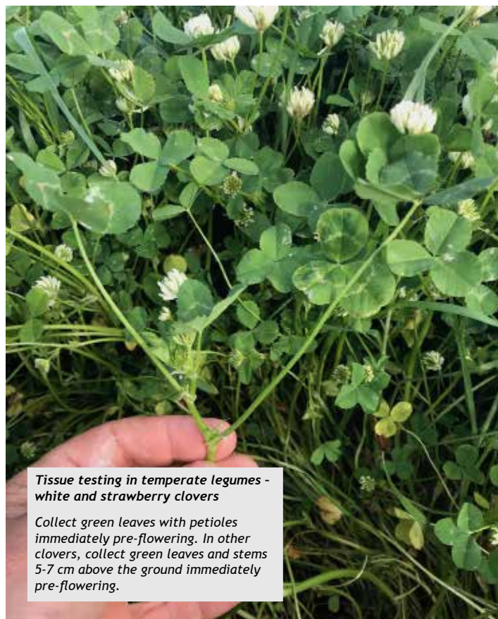
Tissue testing in temperate legumes - white and strawberry clovers

In most cases, 50-100 g of Mo/ha will rectify deficiencies. It can be supplied with SuPerfect ® fertiliser.