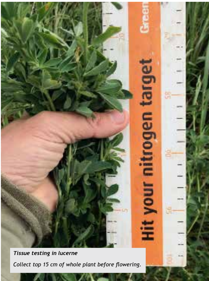
Tissue testing in lucerne Collect top 15 cm of whole plant before flowering.

If tissue testing identifies low micronutrient levels, graziers can apply a small test strip in the pasture to confirm a nutrient response before applying the nutrient more widely across the farm.